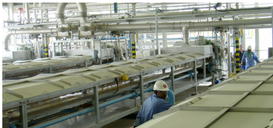
Figure 1. Four Rotoform HS units in operation at a major refining facility.

The reasons for this growth are simple: a combination of increased fuel production to meet global demand; the refining of oil and gas with higher sulfur content; and ever more stringent environmental legislation, driving sulfur recovery efficiency levels as high as 99.9%. About two-thirds of this sulfur, which arrives from the extraction process in molten form, is then solidified. Why?