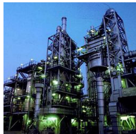
Figure 1. Modern hydrocracker operations benefit from improved internals and reactor control schemes.

The combination of the reactor internals revamp and an improved reactor control scheme enables a reliable operation for hydrocracker reactors. ■